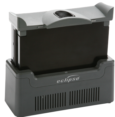
Desktop Charger PN #7112-SEQ